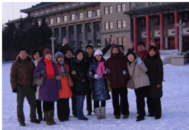
With students in the snow

Most who have served in China would agree that they received much more than they contributed. As one long-time China worker put it, "They may have left China, but China has not left them." They gained new friendships. They left with cherished memories and with new perspectives on themselves and what it means to be a follower of Christ in a land not their own. Through their lives they imparted a life-changing message, but in the process they were changed as well.