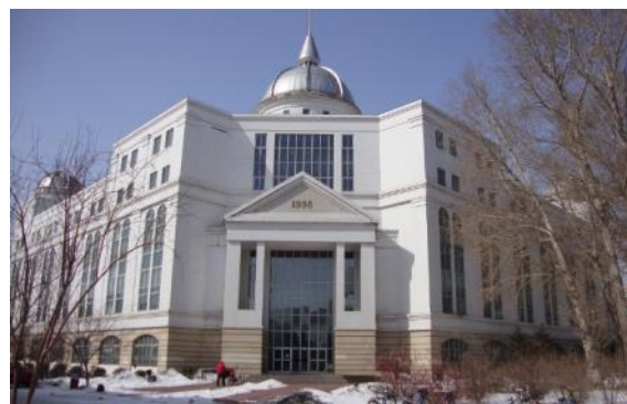
A university in China

Below, the questions and answers are given verbatim followed by the editor's commentary on issues they highlight.