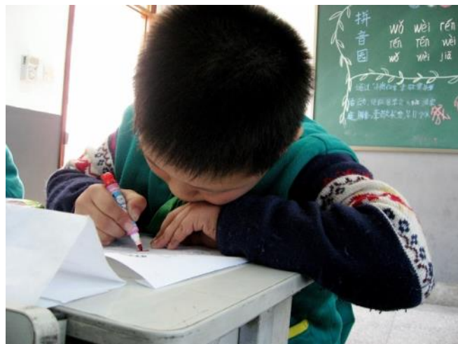
Focused by Kyle Taylor via Flickr

Why would a nation drive its young so fiercely to get an education? What is the nature of education in China? What are the pros and cons of the system? What can the West learn from the Eastern educational system?