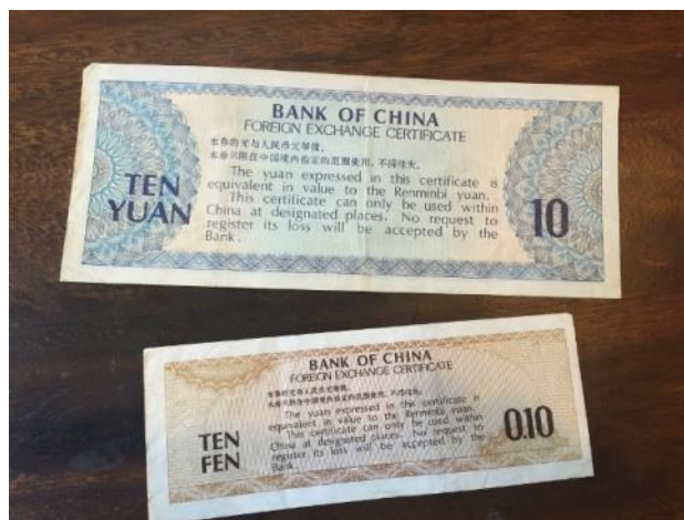
Foreign Exchange Certificate (FEC) of China. Back side. 中国 兑换 元

These earlier students were very diligent and respectful. If the teacher got to the classroom before they did, they were very embarrassed because students are supposed to wait for the teacher. During break, if the teacher started to erase the board, a student quickly took the eraser and said, “This is the students' job.” While most students had been relieved of their work responsibilities, occasional-