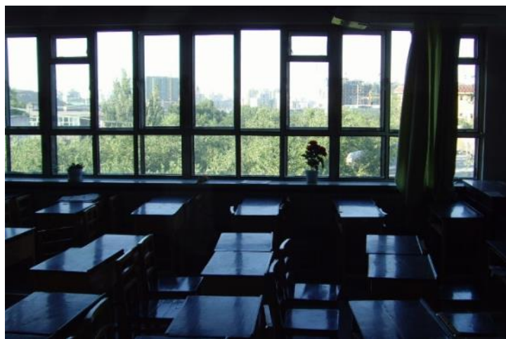
Urumqi foreign language school's classroom by Aaron.huo via Flickr.

Most teachers deal with plagiarism. Knowing what plagiarism is, why it is wrong, and how to avoid it are key skills for anyone in academia. Before students' first written assignment, I explain how plagiarism is equivalent to lying, cheating, and stealing. I also tell my students what the consequences will be if they are caught. I teach them how to reference their sources and give them opportunities to practice. The students learn not only the style of the bibliography or references section but what statements should be referenced and how to paraphrase and summarize the source without changing the meaning. However, there are always those who copy anyway. Their excuse is usually, "I can't write as well as they can." Some students are afraid of getting a bad grade because of their poor English. However, for other students, getting caught is the first step in understanding the seriousness of plagiarism. For those