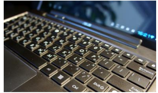
Keyboard by Ash Kyd via Flickr.

History matters. 1 As the Teacher writes in the first chapter of the book of Ecclesiastes, “There is nothing new under the sun.” Today’s questions and challenges are repetitions or at least variations of things that have happened before. Knowledge of the past is an invaluable tool for understanding the present, enabling informed students of history to avoid some of the pitfalls and stumbling blocks that waylaid previous generations of servants.