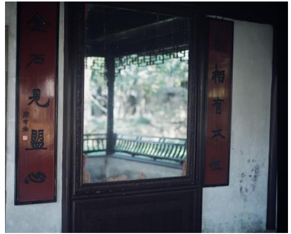
Through the Mirror by Lyle Vincent via Flickr.

History is like a mirror. For many things that are happening today, countless similar things have occurred repeatedly throughout history—and the church is no exception. If the church can draw lessons from history, then the church can better influence the world. If not, then the church will only be like Israel, ceaselessly wandering in the desert, to the point of being swayed by the world. For believers, familiarity with history makes it possible to understand scriptural truth more clearly, to better understand God’s will, and to better live out our faith. Chinese Christians generally do not understand Chinese church history, and so we often have no means to properly respond to changes in society.