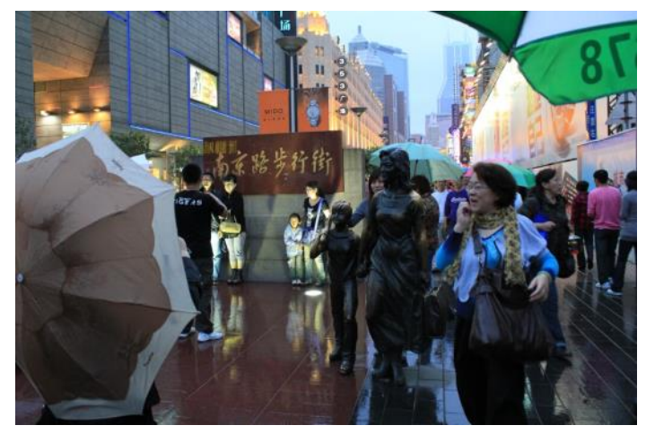
Rainy day in Shanghai

Since market reform in the late 1970s, fast urbanization has been the second structural transition in Chinese society. To those who believe in social progress, urbanization is a trend worth celebrating, and an urban living style is a sought-after dream. However, urban sociologists (Emile Durkheim, Max Weber and George Simile) long ago warned against the negative effects of urban conglomeration on social relationships, including increasing social atomization and anonymity, dispersion of responsibilities, rising crime rates, urban inequality, and relative deprivation. Living in an urban setting also has implications for the social psychology of its residents, sometimes termed as "an ontological anxiety," that is, the loss of one's selfhood and identity while trying to measure up