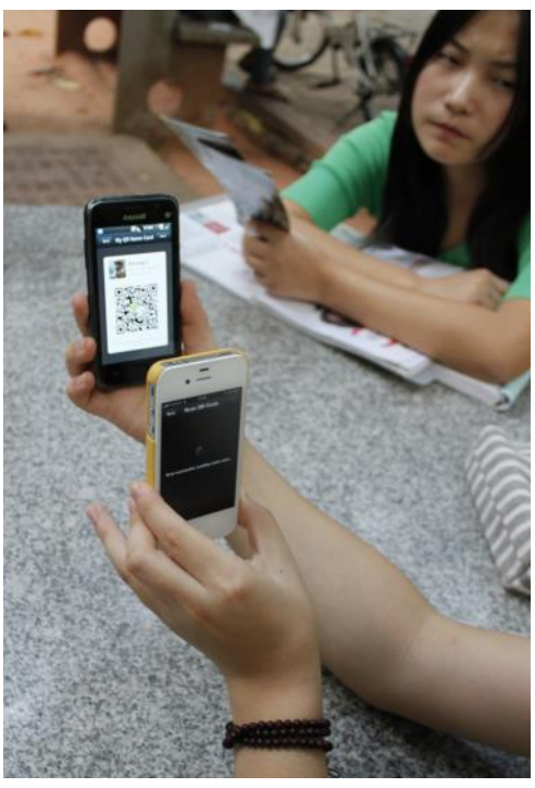
MG 2617

The use of new media has extended the spread of Christianity into the huge public space. In a sense, the media has illuminated the public nature of the church so that the church can enter the mainstream with the right of discourse and have broader influence. At the same time, a church's internal issues—especially negative events—can easily be brought into the public space for discussion and attract social attention. So,