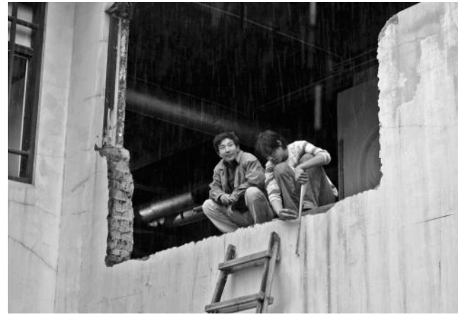
Workers having a break