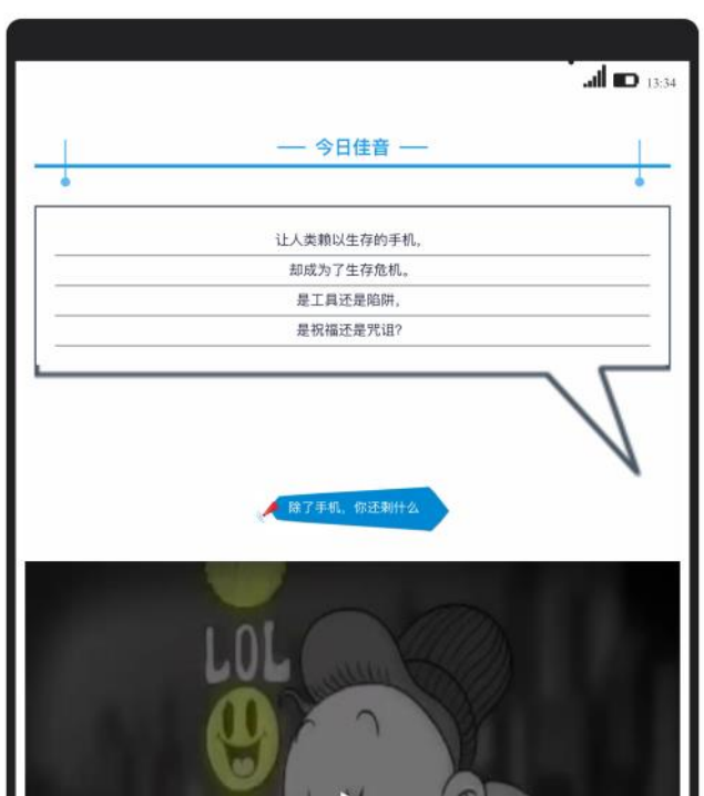
Screenshot of an article via Good News Today : "Don't let your lifeline cell phone become a life crisis" Note: New media is being used to warn about new media.

New media subverts the mass media elements and traditional media business models. With the continuous reduction of technological and cost thresholds, churches and believers can more easily start a so-called media ministry. Taking 2016's most popular live-streaming posts as an example, what was achieved with the use of expensive equipment and satellite transmission by a large number of professionals is now possible with the use of a smart phone connected to 4G internet. With a little more investment, worship meetings at different church sites as well as other events can easily achieve live, interactive broadcasting. Without the help of professionals, the average person can learn to do this. Relevant online training courses are abundant, and most of them are free of charge. Compared with other platforms, new media has become the easiest one to use.