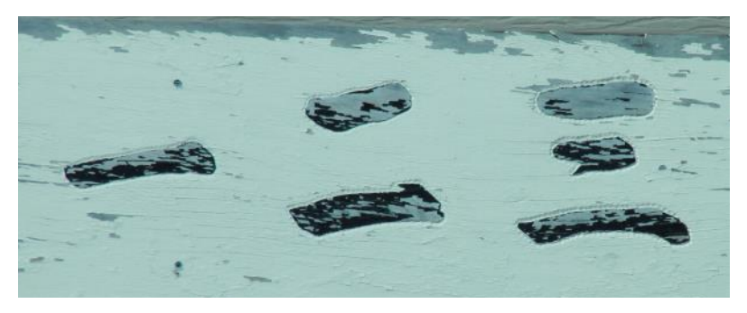
一二三荘

I came to faith in the late 1990s through a student fellowship group on a university campus. Since that time I have been living in a large city and witnessing the urbanization process of house churches in China. By "urbanization of the church" I refer not to a physical church building in a city, but how a church actually takes root in a city and turns into a "a place of harvesting" to influence its community.