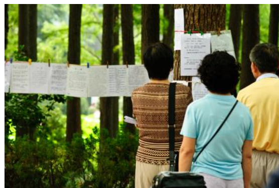
Shanghai park marriage market.

I am forty-two, have never been married. I am looking for a suitable partner who must be a committed Christian. This is the only non-negotiable standard. I don't think it shameful to marry late or not to marry. —Marriage market ad by a Christian female, anonymous