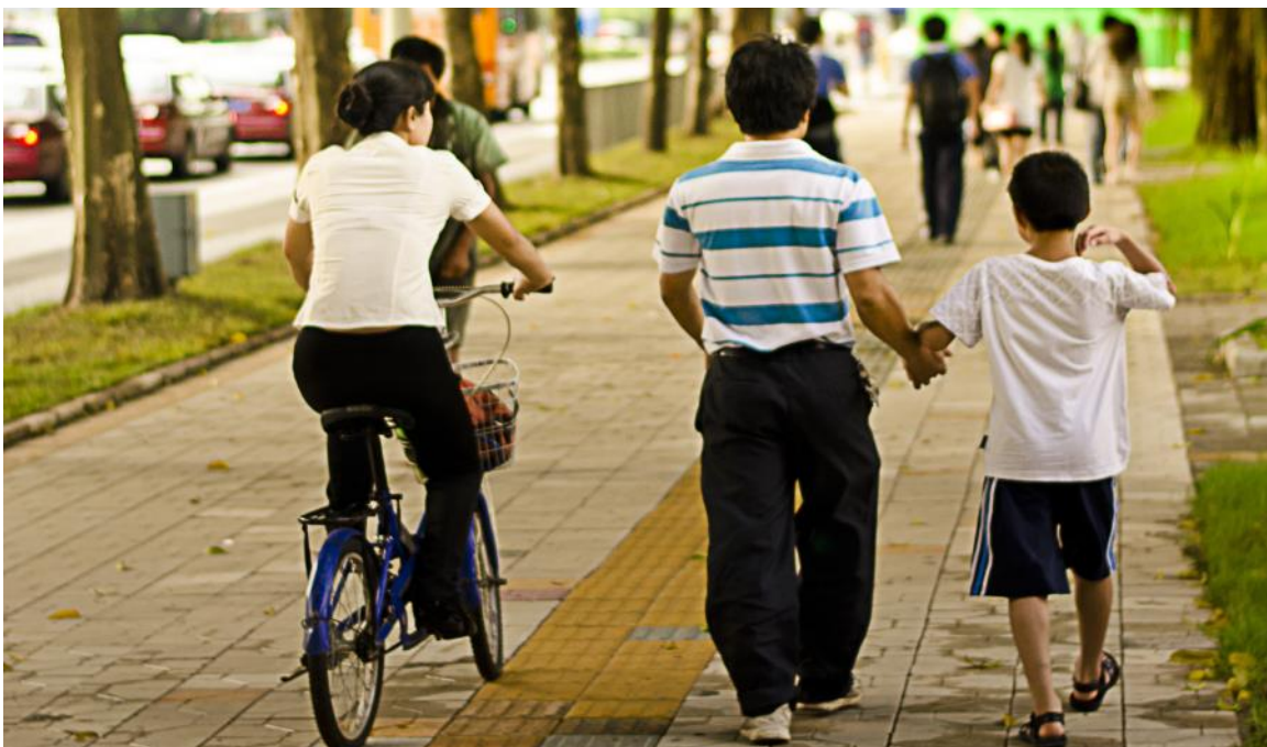
Family Day by !11x16 Design Studio via Flickr.