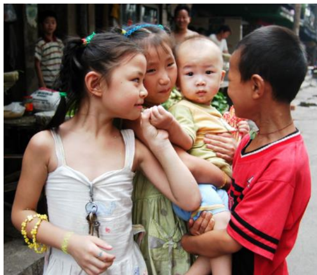
25677-RODSC_0181-DCF

The family is the natural place where the physical and spiritual growth of children takes place and where their spiritual, life journey begins. Because of the closeness among blood kin, spiritual shepherding within the family is irreplaceable. The blueprint for Christian faith is that family is one of the most intimate communities in life and in spiritual fellowship. Such fellowship can teach children to examine their inner self and open their hearts to both God and others. Children can also gain a deeper understanding of their parents' spiritual journey. With this as a basis, parents can talk freely about anything with their children and become their mentors and