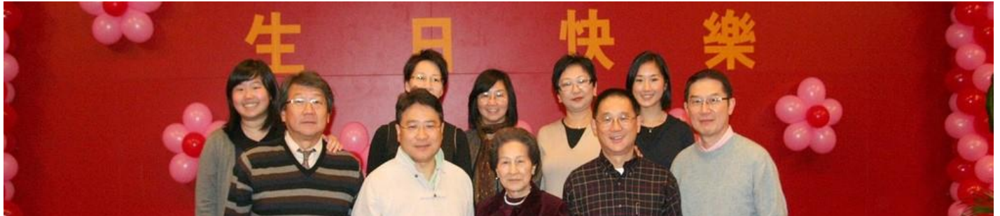
Birthday banquet-Lee family