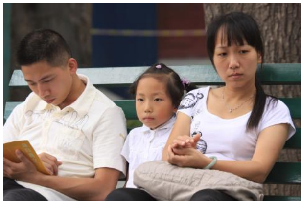
Chinese family by Erwyn van der Meer via Flickr.

Changes in family structure are a reflection of changes in a social system, thoughts, and ideas. Before the 1919 radical, anti-traditional May Fourth Movement, the Chinese were greatly influenced by Confucian thought that sees the individual, family, and world as three inter-connected, orderly components of the cosmos. They used this understanding to guide their ethics, religious life (ancestor worship and heaven worship), and civil justice. It is the individual's duty to take on responsibilities within the family; individual families are organic units of larger families, and this extends to the responsibilities of families in the world.