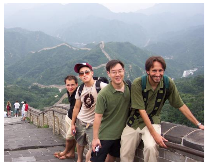
China, Great Wall Of

As a network of people from all over the world who live and work in China, we are a mix of languages, music, special foods, and other customs that enrich our community no end. We also face challenges, one of which concerns the relationships between local coworkers and those who come from the Americas, Europe, other parts of the Asia-Pacific region, and Africa. We often fall into an "us and them" way of relating, with foreigners being treated with respect, kindness, and patience even though at times we can be frustrating to our Chinese colleagues.