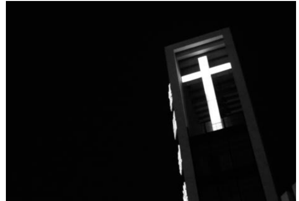
Cross

At the outset of this article, I would like to clarify what is meant by the term “liberalism.” When Christians hear the term “liberalism,” they will likely think about a liberal theological position. Even outside the context of theology, for churches in America the term liberalism still has negative connotations as a worldview that opposes the church’s traditional stance on social and political issues such as same-sex marriage and legalized abortion. However, this kind of liberalism is not what this article is referring to. Instead, among intellectuals in China, the term “liberalism” is understood in the so-called “classical” sense and is often connected with free market, rule of law, and human rights.