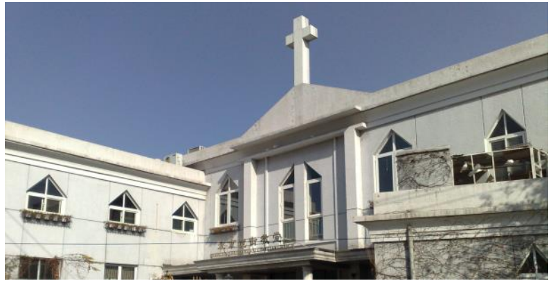
Urban Life, Beijing, China

At the end of 2012, some international news media sources (such as BBC) as well as some mainland Chinese official media sources reported that over 1000 followers of the Almighty God sect (also called Eastern Lightning) were arrested due to promulgating both the imminent end of the world and the Chinese Communist Party (CCP) as the "Great Red Dragon." This concept of Christian eschatology has rarely been raised by China's official media since 1989 and, of course, it is a negative and scornful view. Following the Chinese government's suppression of Falun Gong , the Almighty God sect became the largest religious organization in the public sector open to challenge by the political power of the CCP. Because it has also been labeled a cult ( xiejiao ) by the Chinese government, followers who openly identify themselves with the Almighty God sect are considered to be illegal.