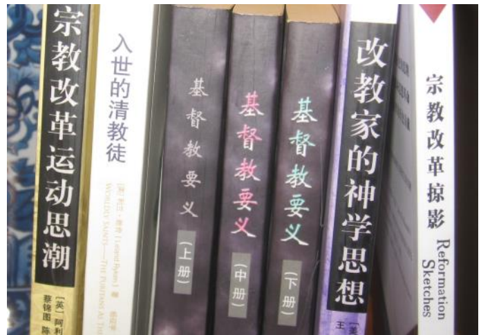
Swells in the Middle Kingdom