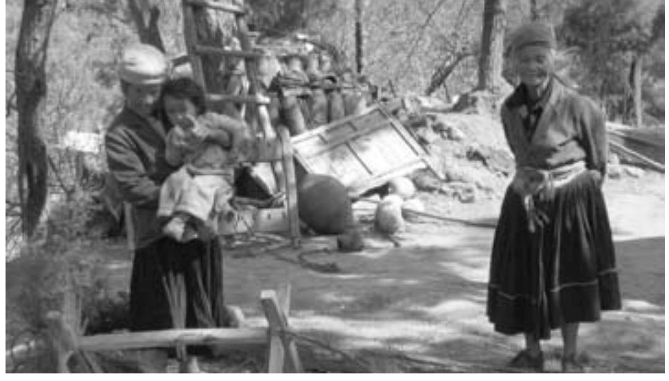
At the end of the day, most important is not the model but that lives are being changed and communities are being transformed.

ZTCDP seeks to indigenize programs and develop local leadership. This is particularly enhanced by the use of the "participatory method" or style of input sharing. We also encourage the investment of local resources and efforts from the community and the government to ensure ownership and ongoing commitment to sustaining the developments. Several local CHED training teams have been established. These teams are conducting training courses in the selected project villages and are also being invited to neighboring villages. These Training of