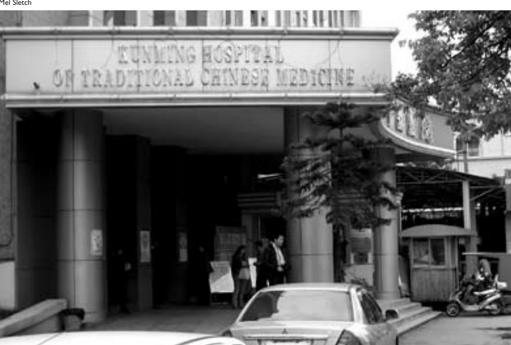
China is now burdened with the problem of many common people being unable to afford health care.

Jesus' ministry involved preaching the kingdom of God, which involved healing of body, soul and spirit. Medical work in China is able to follow Jesus' example by