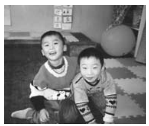
Preschool children in a privately started classroom learn how to make friends.

The impact of disability on a family is difficult no matter what country they live in. Guilt, anger, and hopelessness are just a few issues that are compounded by superstition and social isolation. Add to this mix some very real problems and you are looking at a family in distress. Gone is