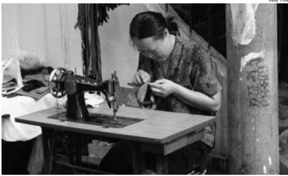
For low income people, a major illness means loss of position at work, loss of job, and then, even the loss of life.

Unacceptable practices push the cost of medicine even higher. Doctors, especially surgeons, routinely accept large gifts from worried patients or their relatives who, prior to critical surgeries, are fearful of the loss of life. Even worse, this practice of a "gift for life" becomes an expectation. Thus, a major medical problem can bankrupt many people. Fully aware of their limited options, many individuals have chosen to steer away from hospitals and let their body's own mechanisms work until death overtakes them.