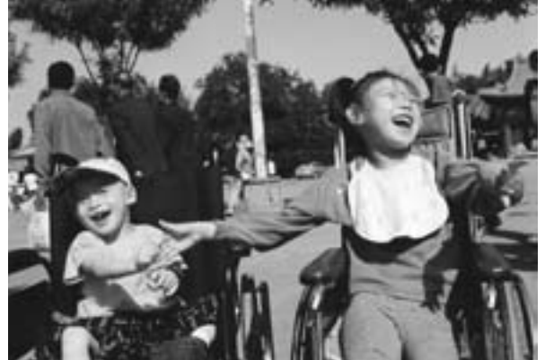
Two students from a privately started classroom enjoy a community outing to Tiananmen Square.

the future university graduate who will support them in their old age. With no brothers or sisters, who will care for this child once the parents are too old? The only answer held out to these desperate parents is to find a cure, no matter what the cost. Running from one hospital to another, they become prey to unethical physicians willing to do unnecessary surgery to pad their salary. Others honestly, but erroneously,