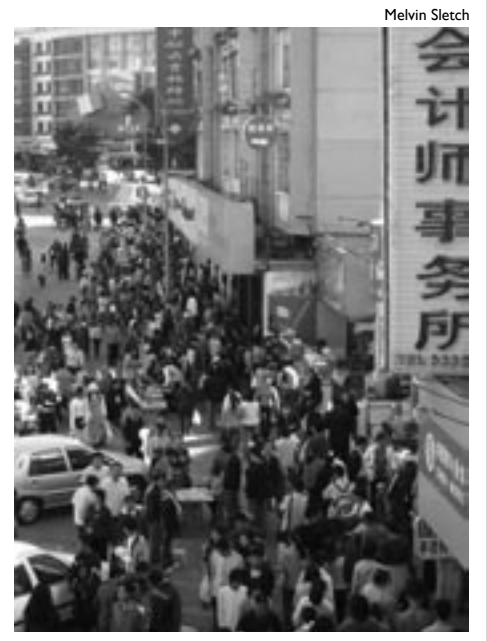
Any change in China would require a lengthy process given that China is a large country of 1.3 billion people.

lengthy process given that China is a large country of 1.3 billion people. However, as long as human rights are considered to be gifts from the government, any laws that are enacted will reflect the will of the ruling party and not necessarily that of the people. Legislation coming from the bottom up by the people would make a significant change in this current model of top-down power concentration. This means that every effort from individuals to secure human rights would be valuable and meaningful, and such effort should be supported and encouraged. Activities to secure human rights in various domains should continue to provide more openness and more governing by law. China has hope as long as efforts from the people continue to come forth.