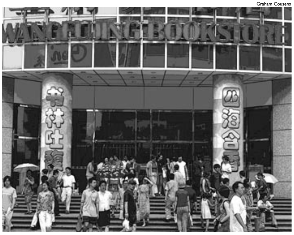
China enacted a multitude of laws and regulations bringing a semblance of regularity to business ventures owned by Chinese themselves.

Consumers were not far behind. For China's economy to sustain its growth into the new century, it became obvious that there would need to be a large increase of domestic consumption—the Chinese people would need to buy a lot of products produced by Chinese businesses. The problem was, however, that Chinese products were defective, dangerous, inferior, fake, and the Chinese did not want to buy them. In 1994, China passed the Consumer Rights Law followed by the Product Liability Law and the Advertising Law. These put pressure on Chinese businesses to increase the quality of their goods and provided means of redress for consumers who got stuck with faulty products—such as the right to go to court and obtain compensation from the company selling the prod-