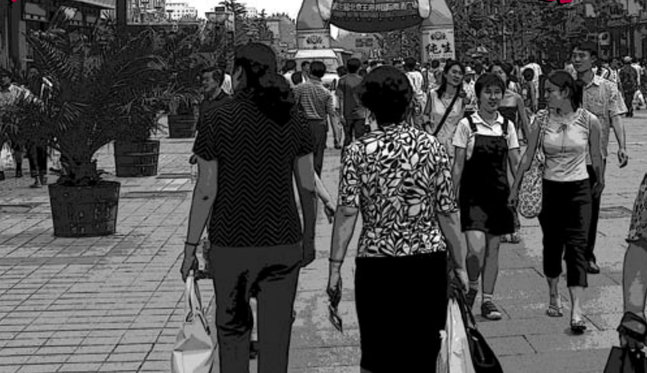
After decades when the "masses" were expected to blindly follow the lead of the party leaders at every level, the idea has been spreading that people are not just subjects to be ruled.