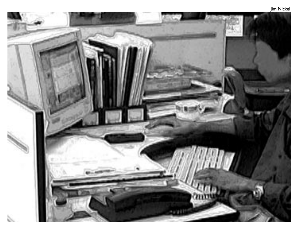
Internet access for more than 87 million Chinese is especially powerful in fueling the new public conversation about rights.

A major factor in the greater balance of power between state and society is the growing access to information after decades of state monopoly. The quest for economic development in China began the process of rights protection, and the fruits of economic development have fueled the process—especially the spread of new communication technologies such as radio (currently 1,000 stations), cable television (currently 100 million subscribers), and satellite television (with dishes popping up in the remotest of villages).