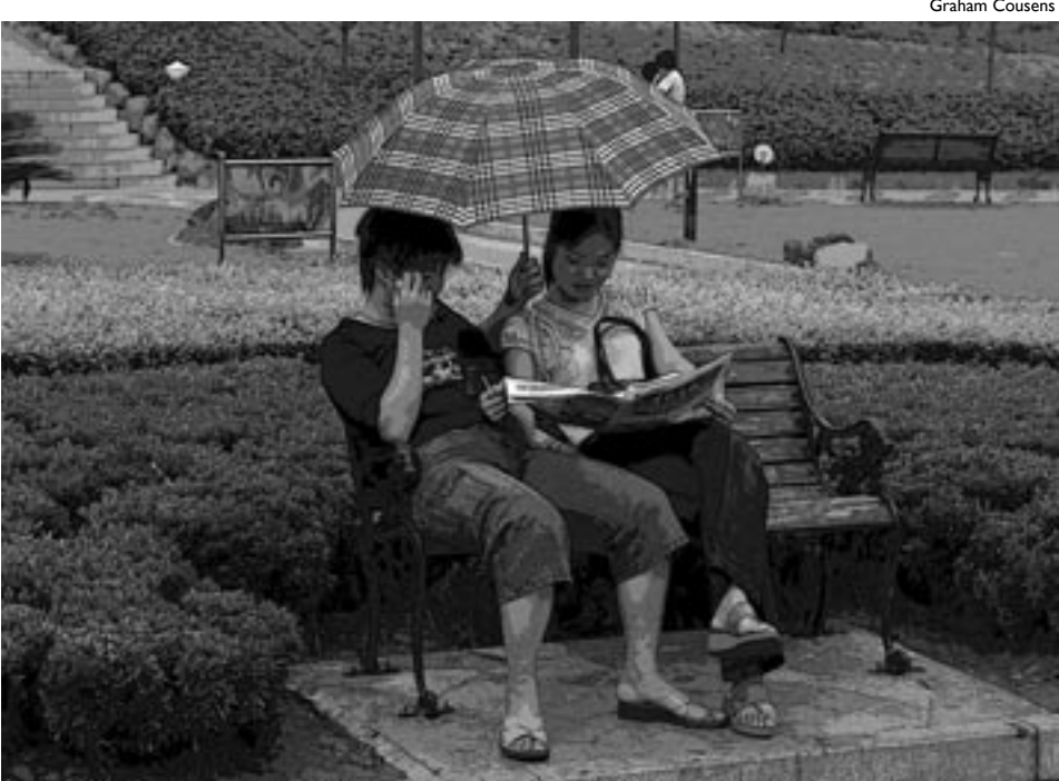
Women's rights have become a popular topic.

on AIDS related issues, and top leaders were photographed shaking hands with patients. Yunnan province has pioneered a law forbidding discrimination against people infected with AIDS and their families. There is a new focus on the needs in the rural areas where the lack of health insurance coverage and a minimal public health infrastructure mean financial devastation and incapacitation or early death for those who become ill.