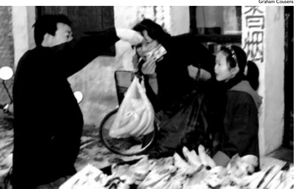
The average Chinese citizen does not view it as necessarily bad to have a religious belief; at the same time, the average non-believing citizen still does not have a high opinion of Christians in the country.

In the rural areas, though, most believers (in ever growing numbers) worship in house churches which still maintain their isolation and their antagonistic stance towards the government. Leaders of the house churches still show the scars left on their bodies from mistreatment in prison