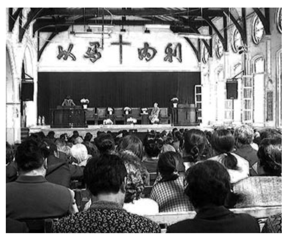
Religious believers in China have shared in the general growing awareness of rights, and as time goes on, more and more believers are demanding greater civil protections for religious belief and practice.

As religious believers take a more active role in engaging with society and government and negotiating mutual