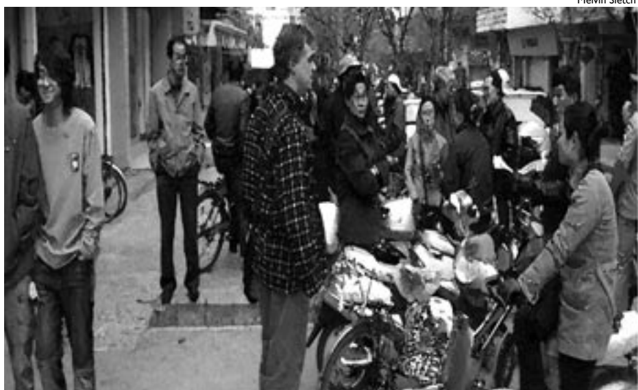
How should a Christian in a foreign country engage the community including the government?

1. Relationships with local and provincial government agencies: Should we proactively respect and adapt to local customs and regulations or should we focus on our message, ignoring local customs and regulations? For example, some organizations were unfamiliar with their local officials except for the visa officer and a Foreign Affairs contact person. Other organizations built relationships with the local mayors, party secretaries and pertinent government agencies like the police, civil affairs and education bureau, and kept up with local TV and newspapers.