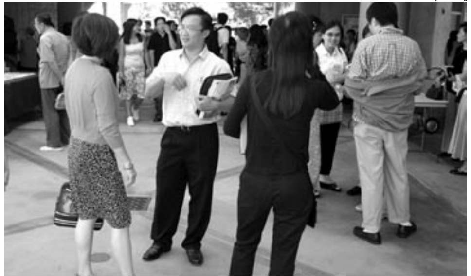
Among the Christian community of the Diaspora Chinese , there has also been significant interest towards ministry in China.

Thirdly, as Hong Kong has become part of China, China involvement for the Christians in Hong Kong is becoming a natural outgrowth of their social responsibility. Certainly, the very vocal stand of Catholic Bishop Joseph Zen towards China has added much fuel. Evangelical churches in Hong Kong are advocating China ministry as “walking on two legs”—Christian witness and social involvement.” Many are in church with full disclosure of their church name and Christian identity. There are also advan-