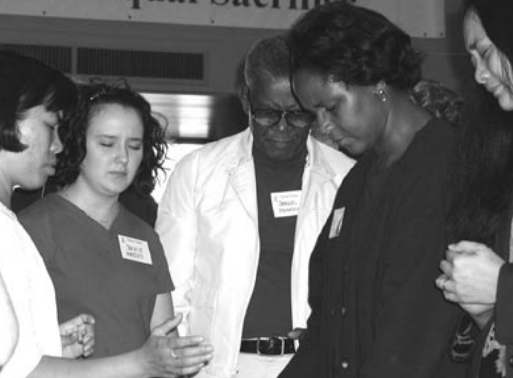
Participants in a "China Today!" Event spend time in prayer.