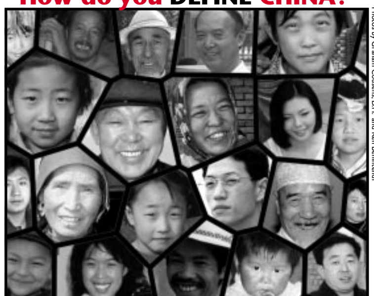
China is a MOSAIC.

tionary days. Some of the poor wish they could go back to the old Communist days, but they are a small minority. The majority support peaceful reform. China's middle class will not allow instability to surface without intervening.