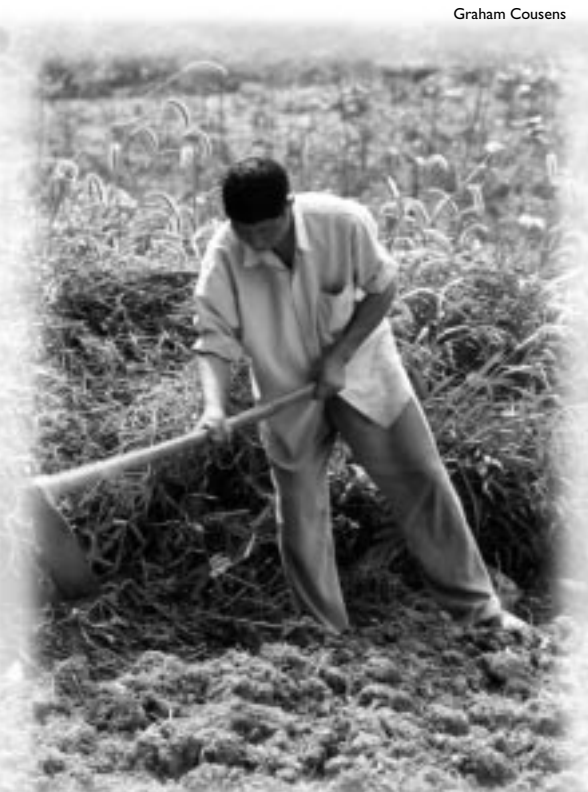
The most talked about sector of doom is agriculture.

from one place to another. Since the beginning of 2002, the government is slowly changing the residential registration system and testing it in various cities. Regional governments are also encouraged to simplify registration systems to speed up the flow of skilled la-