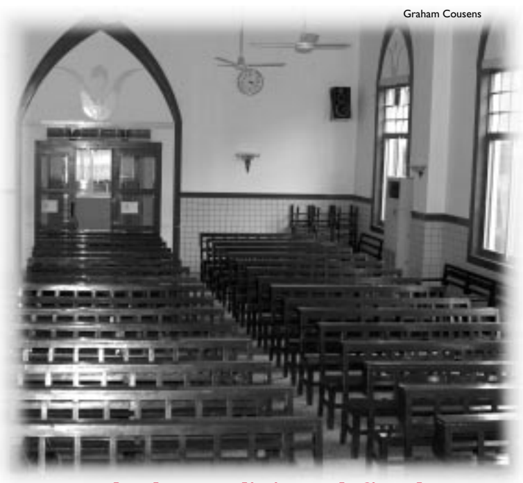
Only those religions defined by the government as normal will be allowed to exist legally in China.

Religious activities will be contained in a defined area of operation. Only those religions defined by the government as normal religions will be allowed to exist legally in China and enjoy the freedom bounded by policy and regulations. Those groups that do not fall within the government's definition of normal religion, such as Falungong, are considered "evil cults" to be prosecuted by law. Furthermore, religious groups within the category of normal religion must register with the appropriate authority in order to claim their legal protection; otherwise they are still illegal and will be prosecuted by law. Currently, the government is drafting nationwide religious regulations as well as many local regulations. At the same time, the government is